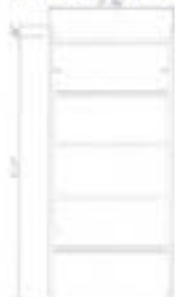
GALVANIZED 15 LBS 12 OZ S-LF5