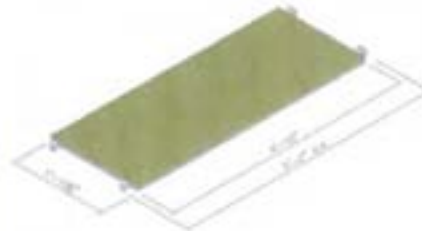
GALVANIZED FRAME w/ PCYWOOD DECK 34 LBS S-5DEK