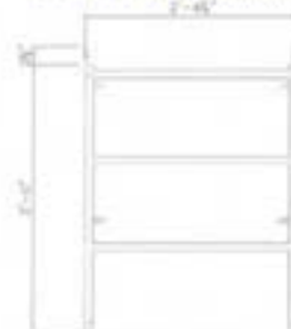
GALVANIZED 10 LBS S-LF3