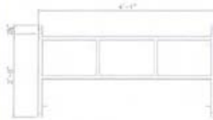
GALVANIZED 10.2 LBS S-SF2